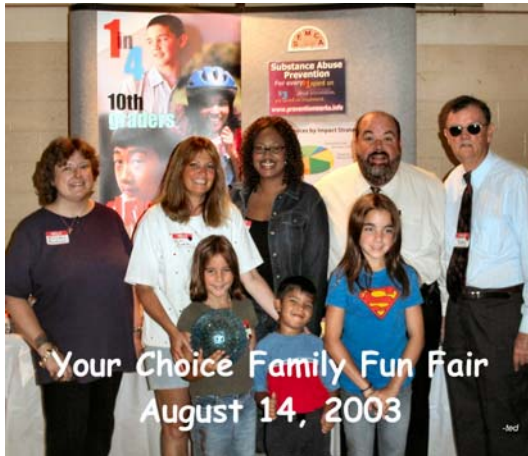
Your Choice Family Fun Fair August 14, 2003