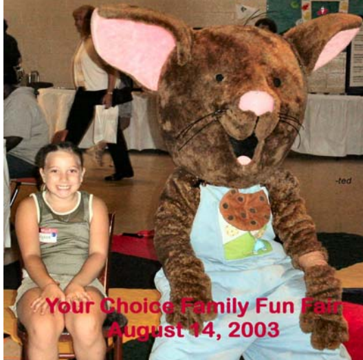
Your Choice Family Fun Fair August 14, 2003